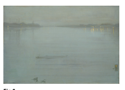
Fig.6 James Abbott McNeill Whistler Nocturne: Blue and Silver - Cremorne Lights 1872 Tate N03420

Nocturne in Blue and Gold: Cremorne Lights 1872 is Whistler's most empty of the night-time London paintings (fig.6). The composition's subtle harmonies are intended to convey a state of mind. From 1872 Whistler started to re-title past works in order to emphasise their tonal qualities and deemphasise the narrative content. At this time audiences for art were becoming attuned to these comparisons, led by their reading of critics who were contributing more than merely aping fashionable musical terminology. The theme of musicalised art became a dialogue between artists