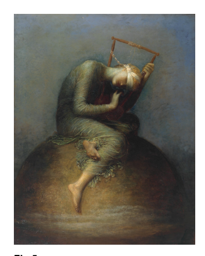
Fig.5 George Frederic Watts Hope 1886 Tate N01640

Ghirlandata 1873, for instance, female allure is associated with music, specifically a harp. Echoing this connection, in 'Two Fine Flowers of Celticism: Encores' (1897), Israfel, the aesthetic writer Gertrude Hudson, used a painter as protagonist in the story to explore musical experience as a form of ecstasy. Losing 'consciousness with the thought of music', the fictional painter goes to Tristan and Isolde for inspiration. 'As he heard the divine first orchestral sighs of "Tristan", he shivered – they held a spirit. As the music rose, passion of love, passion of death, he saw the face, the mouth of music. His soul dilated'.<sup>30</sup> His resulting work was a portrait of music, a 'languishing Orpheus' represented as a woman, because 'music is feminine' and because 'music became his only picture.<sup>31</sup> Was Watts's Hope (fig.5), with its despairing central female figure and one-stringed lyre, being evoked here?<sup>32</sup> Or was it Simeon Solomon's painting