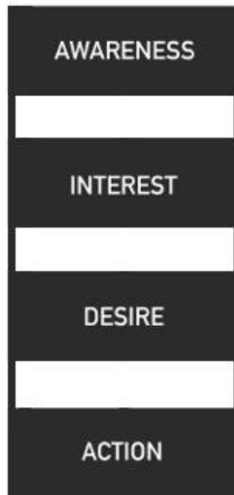
Figure 1 The traditional buyer decision-making model

but it was introduced to a wider public with the publication of Strong's book 'The Psychology of Selling' in 1925 (Charlesworth, 2015). In the digital age it may be appropriate to query the currency of a model of such vintage.